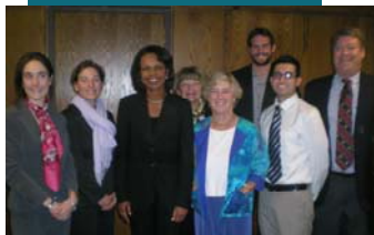
An IVLP Foreign Policy Delegation meets with Condoleezza Rice