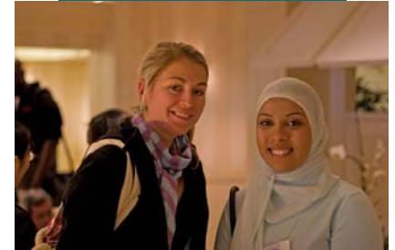
Foreign Fulbright Grantess at a Fulbright Seminar