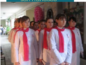
Komen Global Initiative Grant Project in Ukraine present "Tell your Mother about Mammea...."