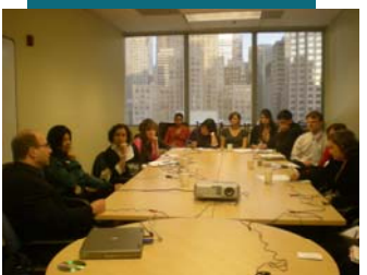
An IVLP Delegation meets with Craig Newmark of Craigslist