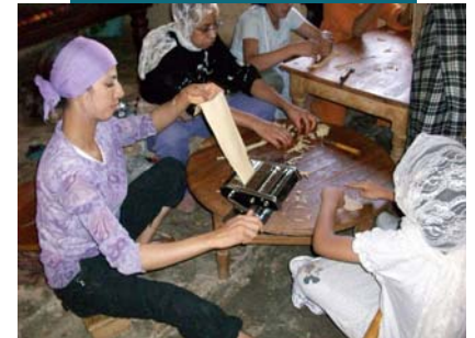
A WIT PDN group start their own catering business in Morocco

To date, over 6,500 women have graduated from the WIT program throughout nine countries in the Middle East and North Africa. After completing more than 200 hours of training in basic Microsoft skills, a 1/2 day of blogging training and a 5 day leadership and professional development course, many of these graduates go on to form Professional Development Networks (PDNs) in their local communities. These networks enable the women to stay connected with other WIT graduates and to serve their communities. One PDN group in Yemen recently held a training on AIDS Awareness for over 300 students at 3 local schools.