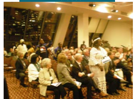
IIE WCC Foreign Policy Event

Since its inception in 2007, the Komen Global Initiative has trained 700 men and women from 350 different organizations in breast cancer awareness and advocacy through the Course for the Cure™. The Komen Global Initiative works with participants from 10 countries throughout Latin America, Eastern Europe, and the Middle East. In 2009, 37 grants were awarded to graduates of the program to further breast cancer awareness and advocacy in their local communities. One grant recipient in Costa Rica provided breast health education trainings for 400 inmates and staff at Costa Rica's largest women's prison. As a result of this project, 86 women were referred for mammography screening.