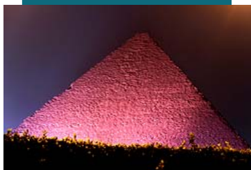
Global Komen For the Cure race in Cairo, Egypt