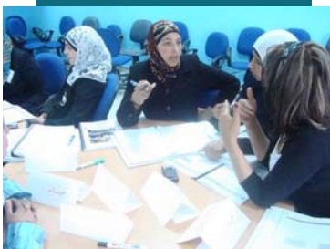
WIT Training in Jordan