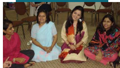
LDM Fellows from India