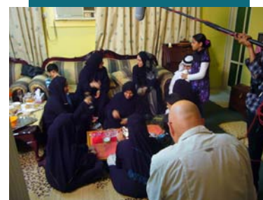
Komen Global Initiative documentary film shoot in the U.A.E.