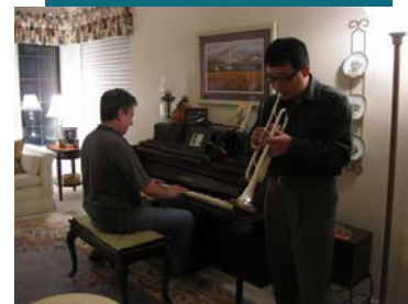
JIAM Visitor receives home hospitality

October was Breast Cancer Awareness month worldwide and the IIE Global Komen Initiative team worked closely with their country programs in Brazil, Costa Rica, Mexico, Panama, Romania and the United Arab Emirates to rally their local communities in advocating for the cause. In Costa Rica, the IIE Global Initiative team joined its leading partner, Dr. Anna Gabriela Ross Foundation, for the Sixth Annual Walk Against Cancer, "Luchemos por la Vida" in San Jose. The walk was a huge success gathering more than 11,000 supporters together, making this the largest fundraising walk/run in Costa Rican history.